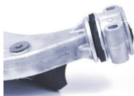
Clean shaft Surface.